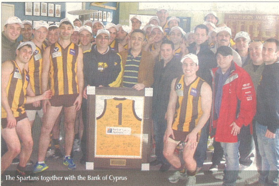
The Spartans together with the Bank of Cyprus

remaining, the Spartans sit two points clear on top and have booked a finals berth in its inaugural season. This is a fantastic effort considering the team was built from scratch. It was a fitting tribute at the end of the match with the Bank of Cyprus representatives joining the team for the singing of their theme